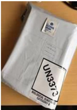
Example of test kit package